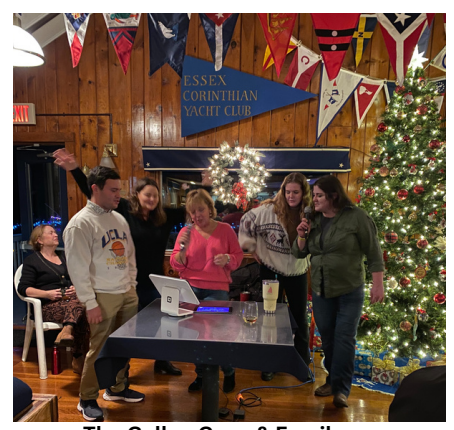
The Galley Crew & Family