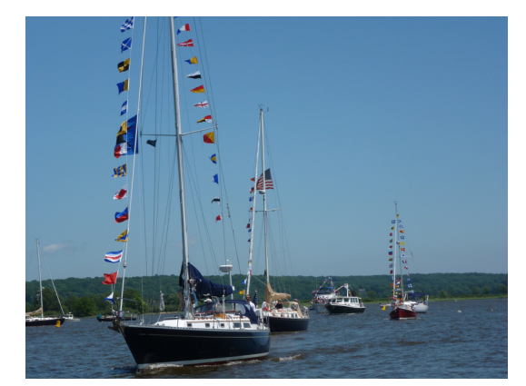
Essex's traditional 4th of July Harbor Boat Parade is back this year on 7/4 at 2:30pm

View from the Bridge In & Around the Clubhouse Entertainment News Upcoming Events On the Water Club Communications